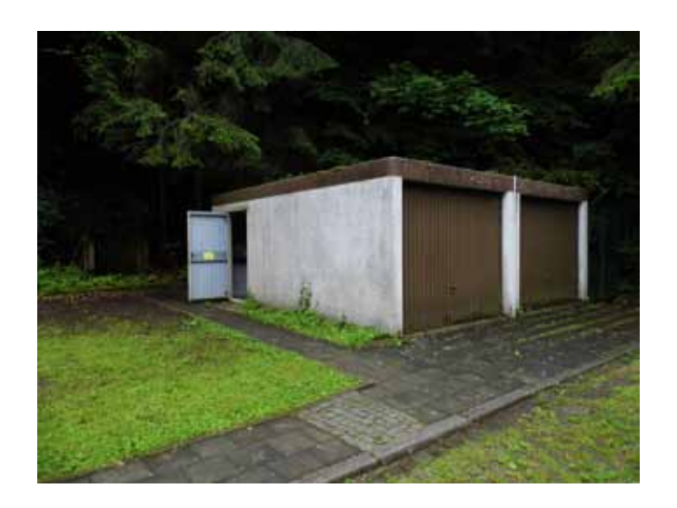
Hidden entrance Ausweichsitz Nordrhein-Westfalen (G)