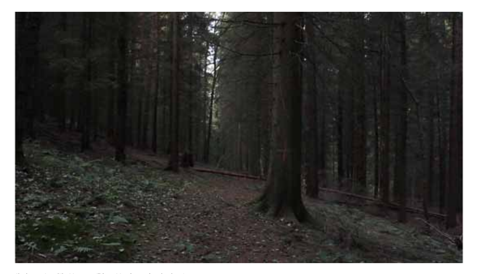
Charles van Otterdijk, CC01.#06, still from CCTV footage found on location 1